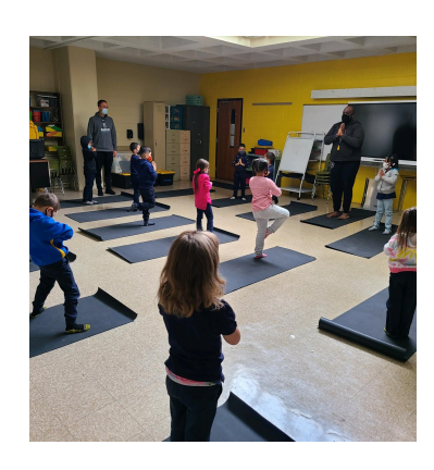
Tier 3 - $20,000

"Making yoga & meditation accessible to everyone, everywhere."